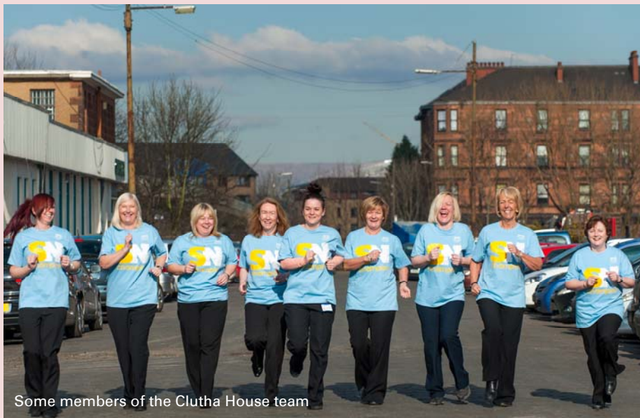
Some members of the Clutha House team

FOURTEEN members of staff returned to work in January feeling sluggish after overindulging over the festive period...but all that changed after January's special 'healthy' edition of Staff Newsletter landed in their inbox!