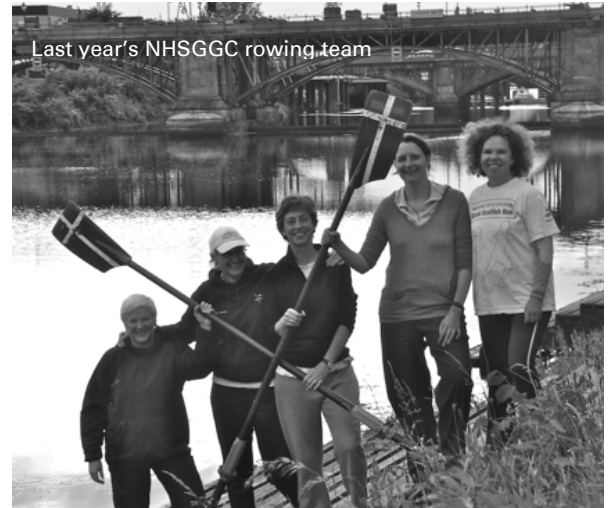
Last year's NHSGGC rowing team